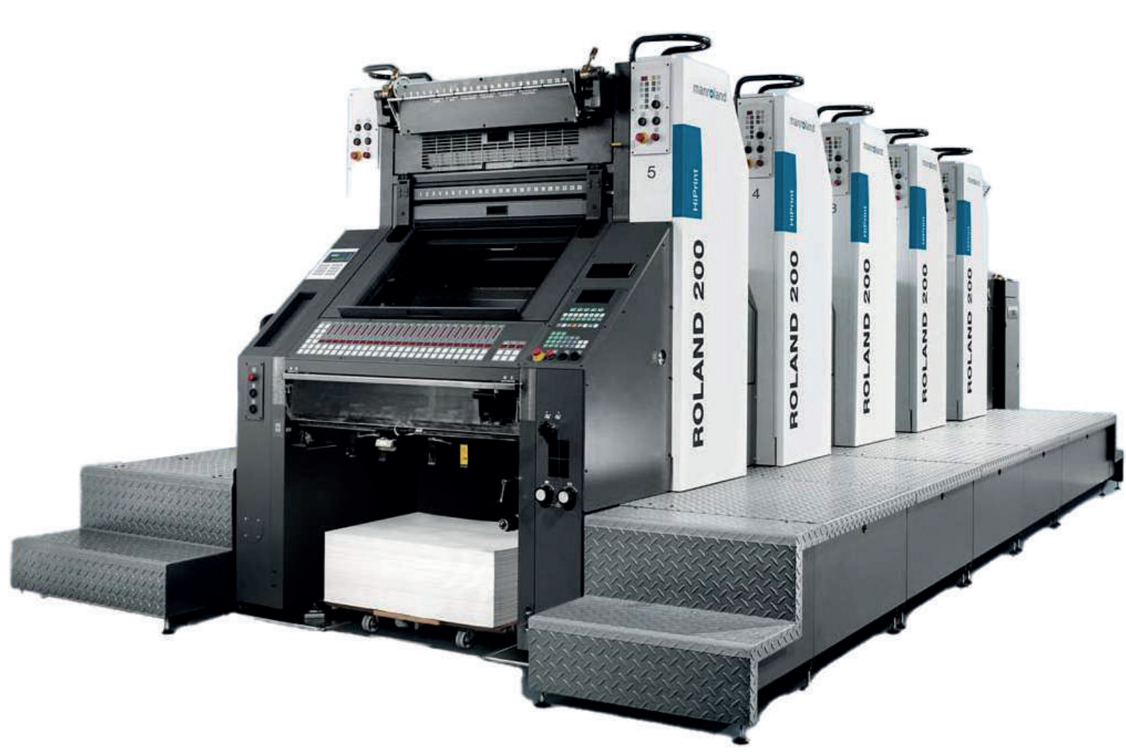
MAN ROLAND 200 2020